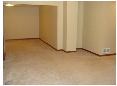
Dining Room-11'9" x12'