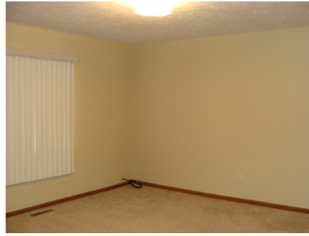
Living Room-13'6" x13'