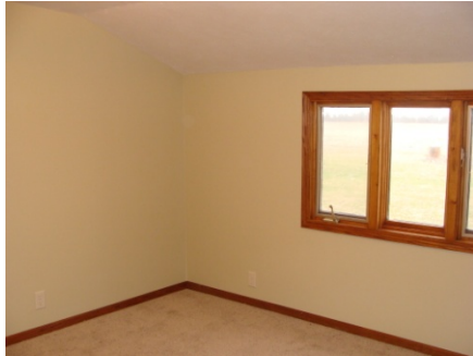
Master Bdrm-9'6" x11'3"